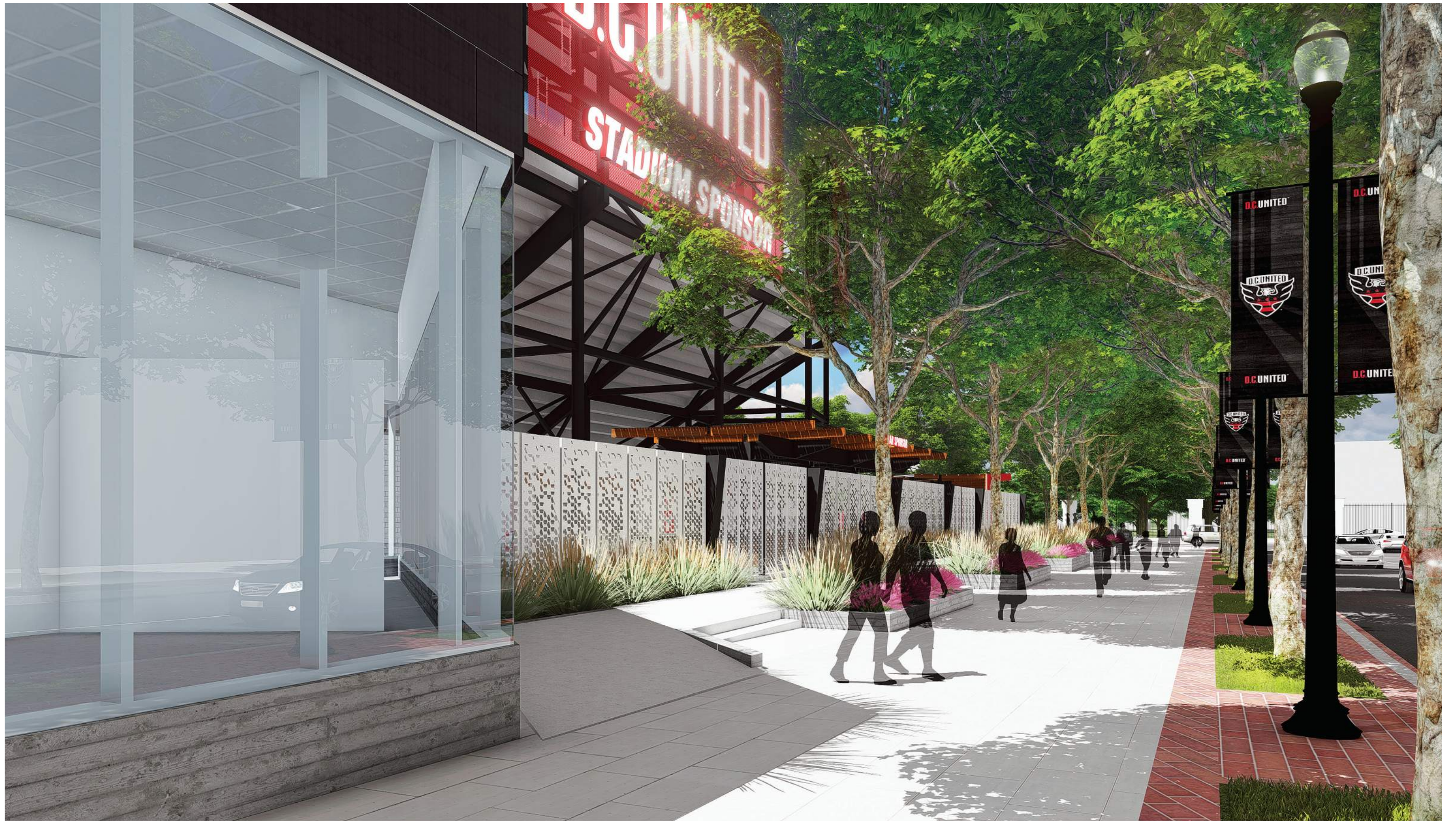
5.17 NORTH ELEVATED PLAZA RENDERING