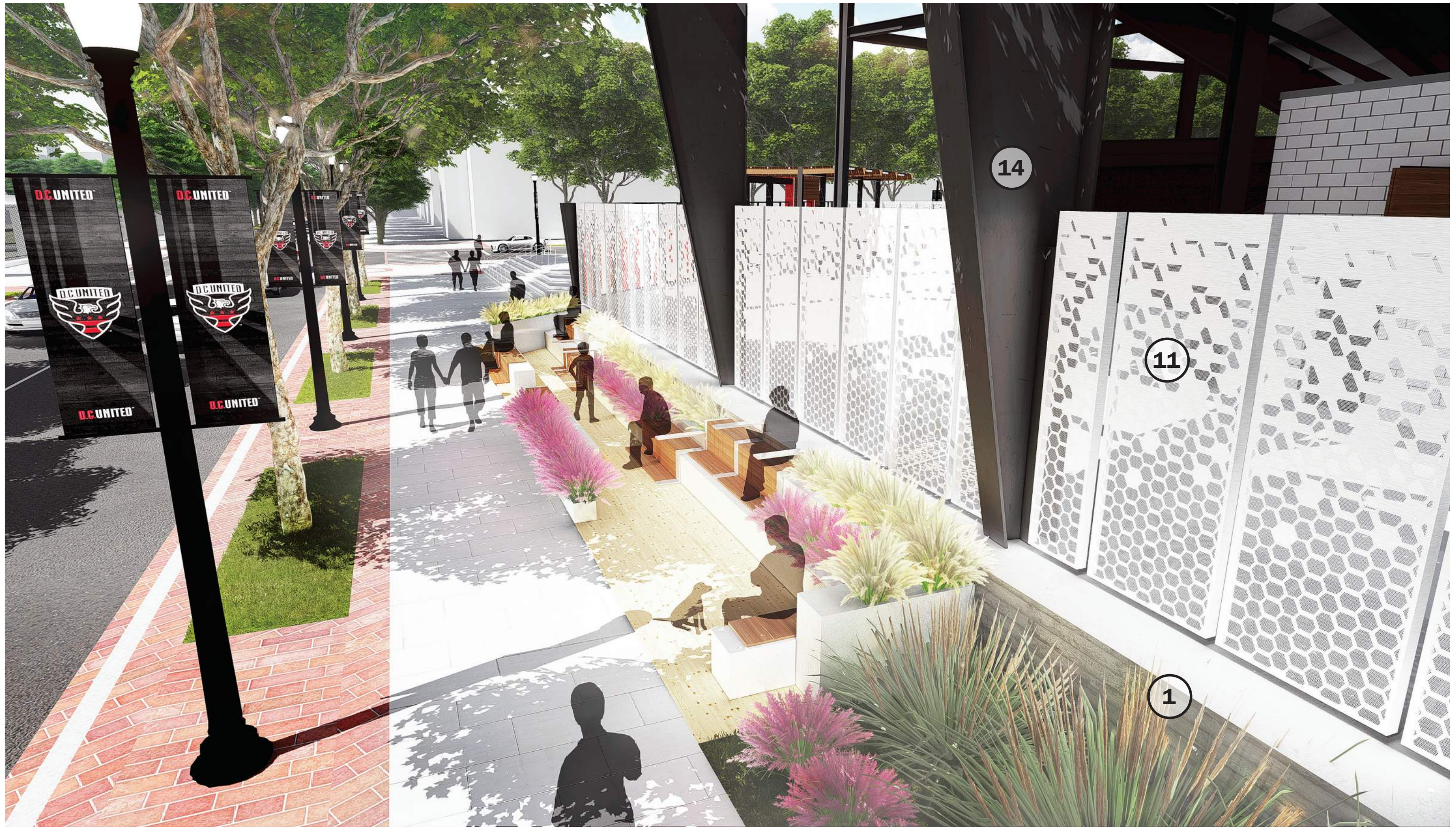
5.21 2ND STREET PARKLET 1 RENDERING